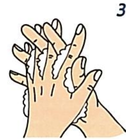
Palm to palm, fingers interlaced