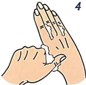
Rotational rubbing of right thumb clasped in left palm and vice versa