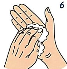
Rotational rubbing, backwards and forwards, with clasped fingers of right hand in left palm and vice versa