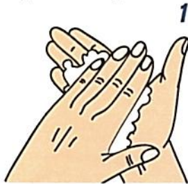
Palm to palm